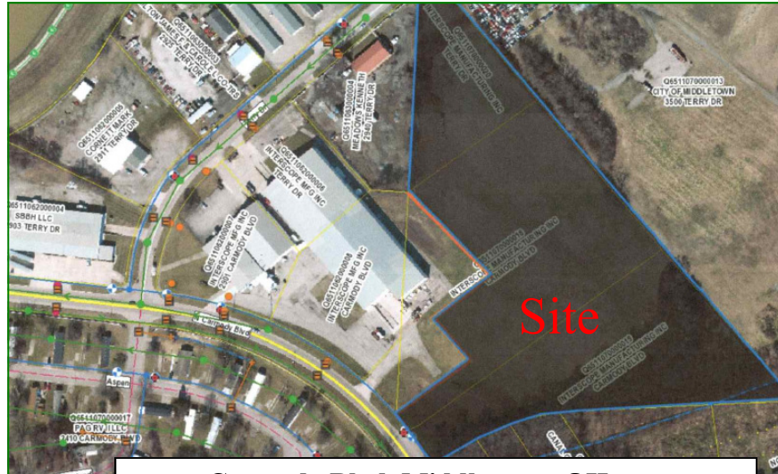
Carmody Blvd, Middletown, OH