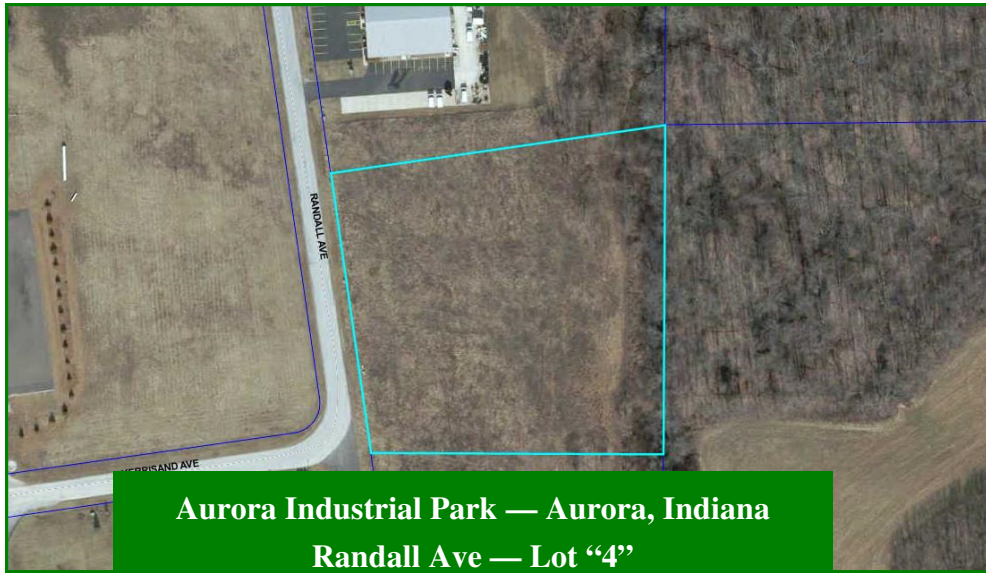
Aurora Industrial Park — Aurora, Indiana Randall Ave — Lot “4”