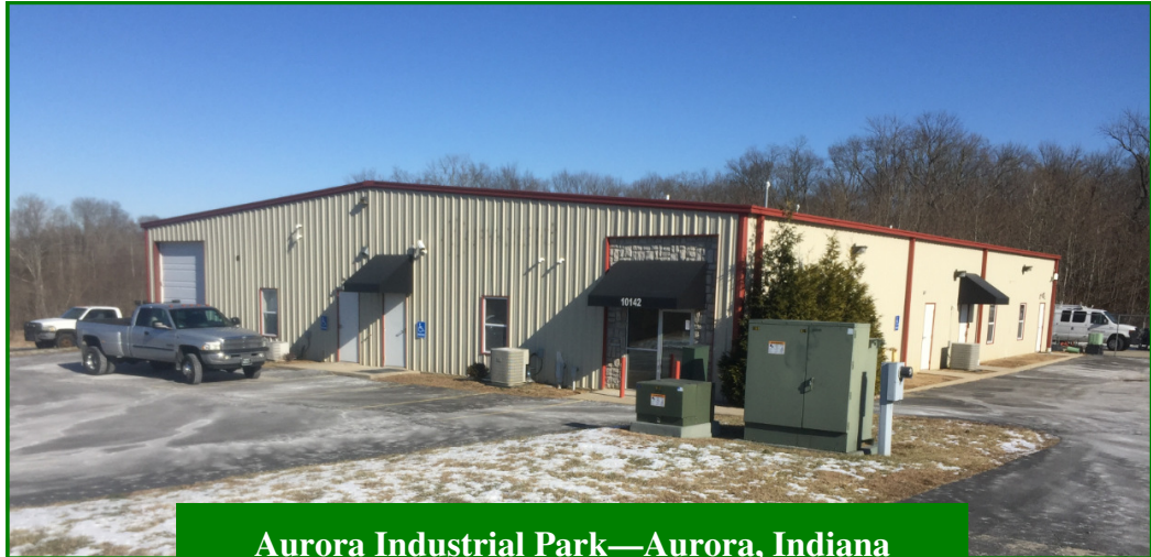
Aurora Industrial Park—Aurora, Indiana 10256 Randall Ave. / Lot “3”