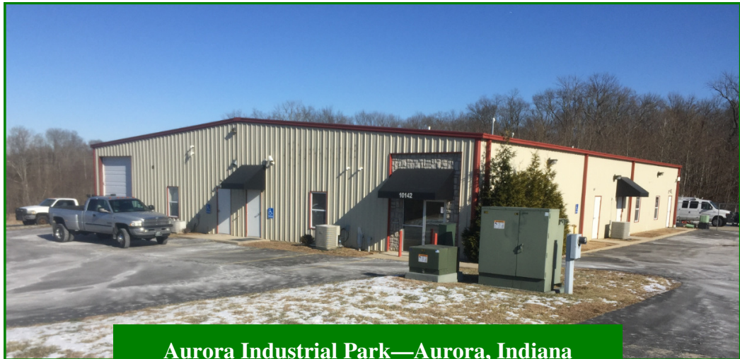
Aurora Industrial Park—Aurora, Indiana 10256 Randall Ave. / Lot “3”