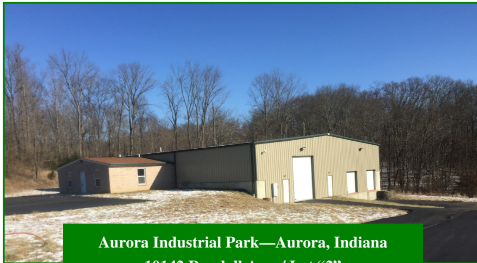
Aurora Industrial Park—Aurora, Indiana 10142 Randall Ave. / Lot “2”