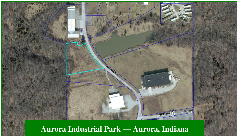
Aurora Industrial Park — Aurora, Indiana Randall Ave - Lot "Batta"