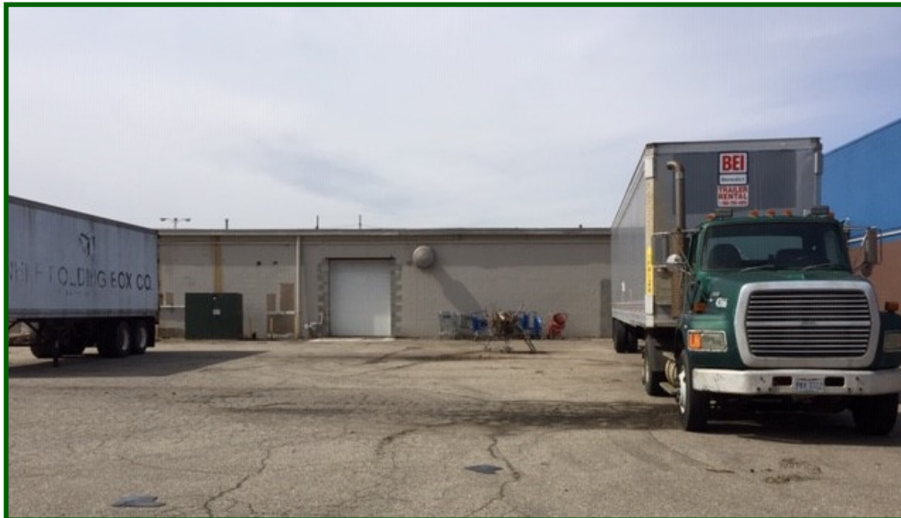
Rear of Building view

Information submitted herein has been obtained from reliable sources. We have no reason to doubt its accuracy, but we do not guarantee it.