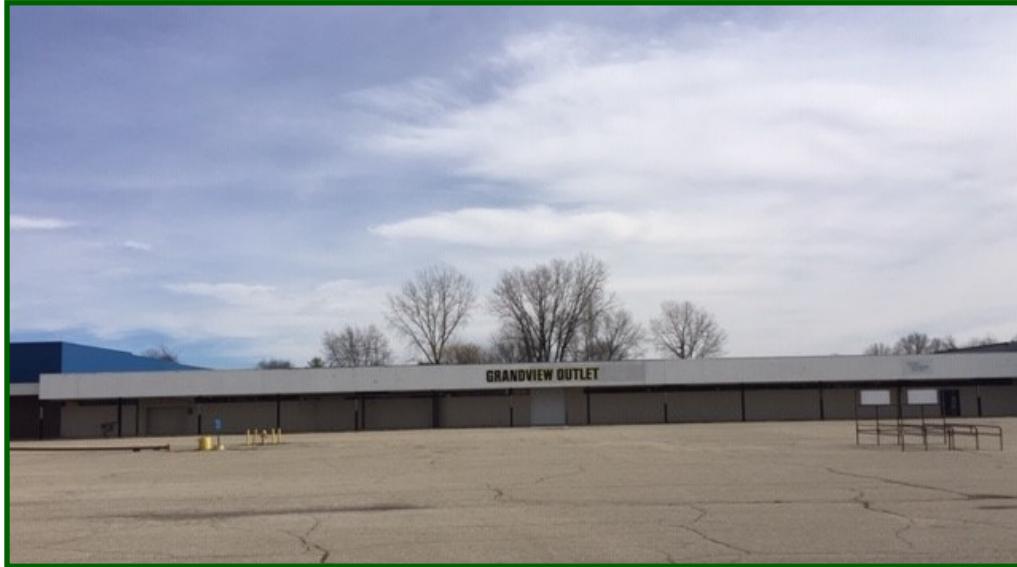
Front of Building view